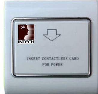
ENERGY SAVING SWITCH HO-ENE-RF