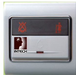
DOOR "DO NOT DISTURB" HO-DND-01